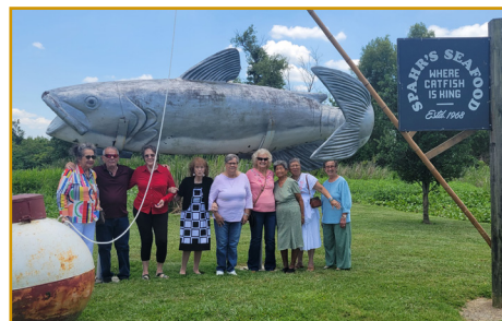
The Wynhoven "Lunch Bunch" is enjoying their trips to different local restaurants!