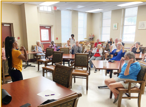
Mater Dolorosa residents had their first exercise class recently.