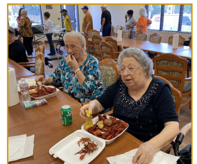
Metairie Manor residents enjoyed a crawfish boil while the mudbugs were still in season!