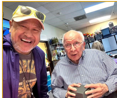
Rouquette Lodge showed appreciation for their volunteers with a luncheon. Thank you for sharing your time to help our staff and your fellow residents!